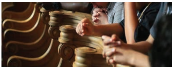
PRAY FOR VOCATIONS

Sunday, February 26: 5:00pm Mass & Grades 5, 6 and 7 Classes to follow in the OLM School Gym