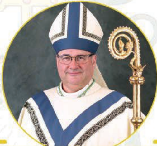
Coadjutor Bishop of Providence

Cathedral of Saints Peter and Paul, Providence